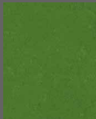
Jazz | CH2824U WR445 / A1M200 / LRV 15