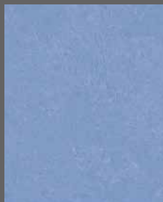
Rap | CH2820U WR441 / A1M200 / LRV 30