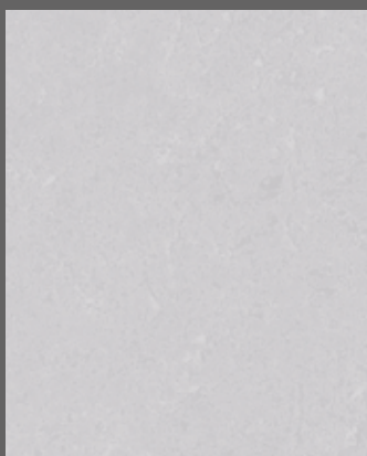
Fusion | CH2813U WR434 / A1M200 / LRV 49