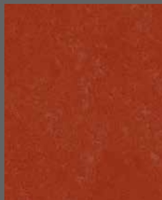
Flamenco | CH2806U WR427 / A1M200 / LRV 12