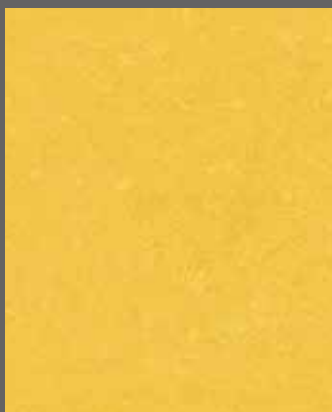
Reggae | CH2801U WR422 / A1M200 / LRV 48