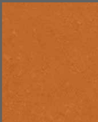
Salsa | CH2802U WR423 / A1M200 / LRV 20