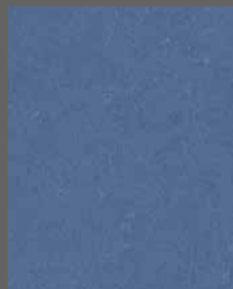
Gospel | CH2821U WR442 / A1M200 / LRV 17

United Kingdom ☎ +44 (0) 1462 707 700 ✉ enquiries@altro.com