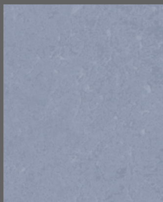
Soul | CH2817U WR438 / A1M200 / LRV 29